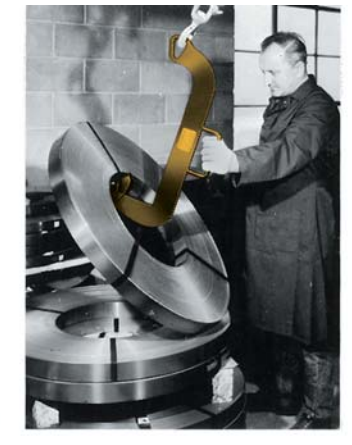
With the hook in place, the wedge pivots as the lift is started, and the coil begins to turn to a vertical position for transporting.