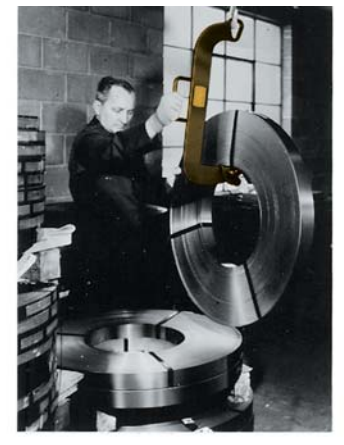
Coil is in vertical position after being lifted from its pallet. The weight of the coil holds the pivoting wedge in the vertical position during transportation.