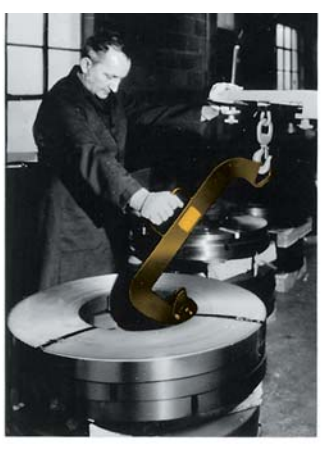
Placing spacer blocks between stacked coils permits easy insertion of the wedge. Lightweight and pivoting wedge makes it easy to position the hook.