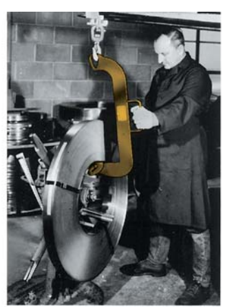
Coil being loaded on a stock reel. Hook is easily removed from the coil after releasing the hoist.