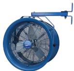
RM Rack Mount