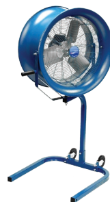
PS Portable Stroller